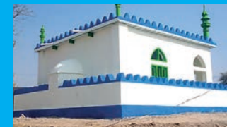
Masjid Dilawar Village KK Khan Pathan Jacobabad, Sindh, Pakistan

Whoever constructs a masjid for Allah, Allah will construct a house for him in Paradise